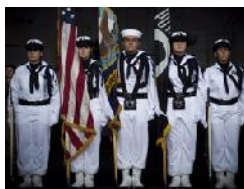
Navy Color Guard